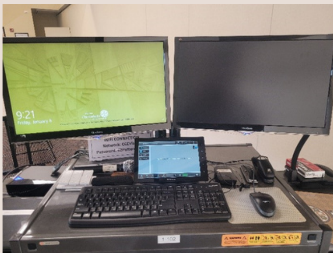
Workstation Connected to Audio and Projector

**Note: New MacBook users need to bring their own USB-C Digital AV Multiport Adapter for HDMI-to-Mac functionality. iPads/iPhones do not connect to our computer workstations.