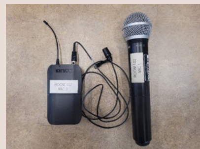
Wireless and Lapel Microphones